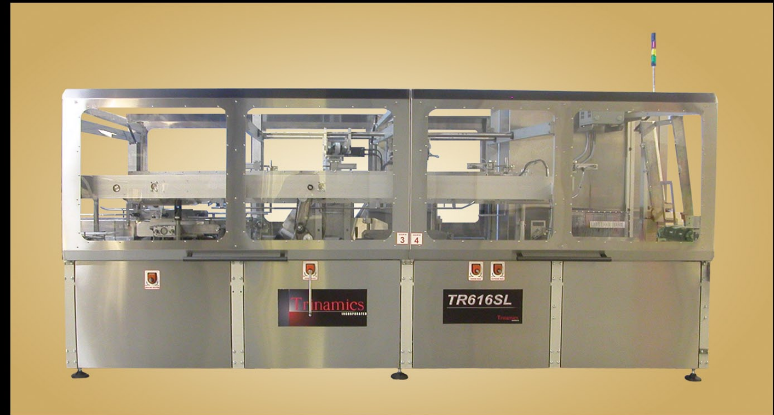
TR616SL & TR616EL

TR616SL Side Load and TR616EL End Load integrated case packing centers are designed to pack a variety of products into the side or end flaps of a conventional RSC style case. Both case packers include product infeed conveyors which simplify installation in the plant. In addition to product collating and product loading hardware, the TR616SL and the TR616EL include case erecting and case sealing modules to suit a wide range of cases. The TR616SL Side Load and the TR616EL End Load Case Packers are available in hot melt and pressure sensitive tape sealing configurations.