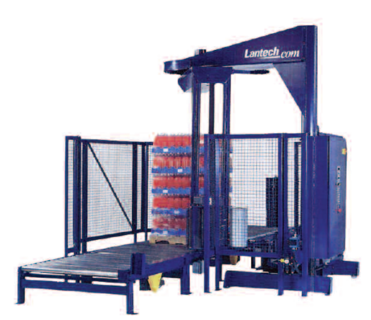
Conveyorized Stretch Wrap System

We take responsibility to ensure your system performs to meet your needs and expectations. Please contact our systems specialist today to explore how our services may fit your needs.