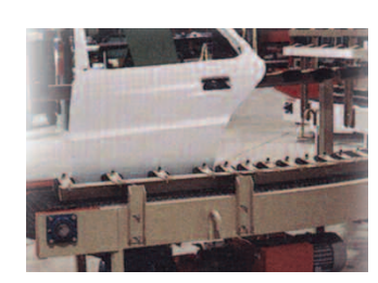
Specialized Product Handling