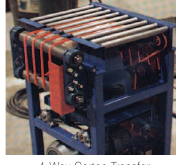
4-Way Carton Transfer