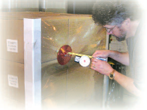
Optimizing force-to-load and ounces of film used per unit load

We can prevent machine trouble from occurring in the future with our preventive maintenance programs. These programs are designed to ensure that your machinery stays running without downtime. Programmed replacement of wear parts, managed cycle time rebuilds and replacements, and other procedures will help keep your production schedule on time.